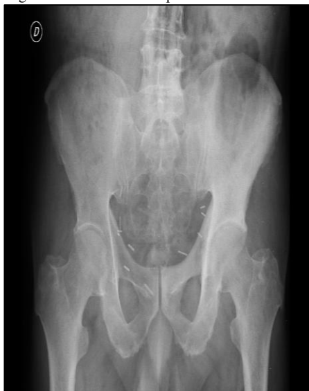
Fig 1. X-ray of a prostate cancer patient with Paget's disease of left hemipelvis